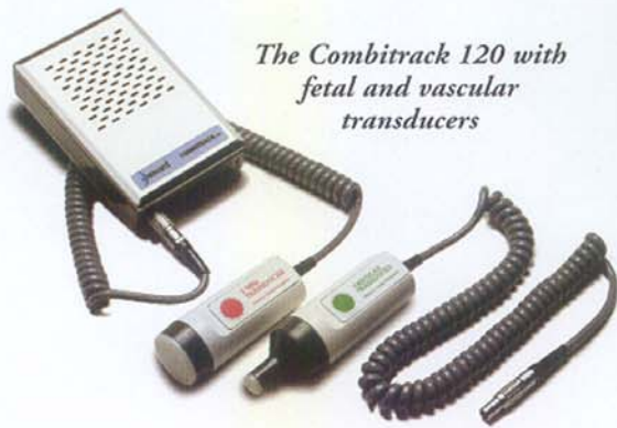
The Combitrack 120 with fetal and vascular transducers